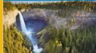
Iconic Helmcken Falls in Wells Gray Park

BC Nature Camp - Land of Fire and Ice: Wells Gray Provincial Park - Hosted by Kamloops Naturalists Club